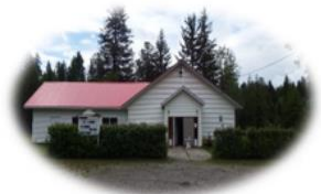
St. Joseph Church