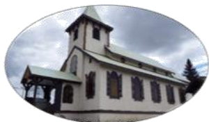
Sacred Heart Parish