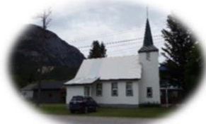
St. Anthony Church